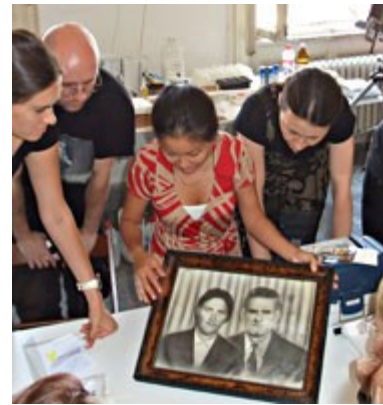
Participants from the course Conservation of Photographs and Photograph Collections for Countries of Central, Southern, and Eastern Europe examine a photograph.