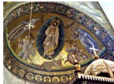
Mosaic of the Transfiguration, in the basilica of the Holy Monastery of Saint Catherine, Sinai.

Find out more information about this free event and make a reservation online.