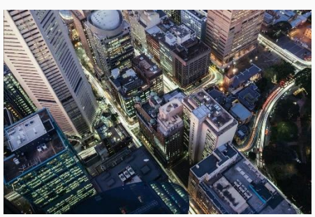
Making Cities Work for Every Body

I believe that we all have the potential to create social impact, and I'd like to share with the world the secret recipe to help unlock that potential in an effort to build cities that work for every body....Read more