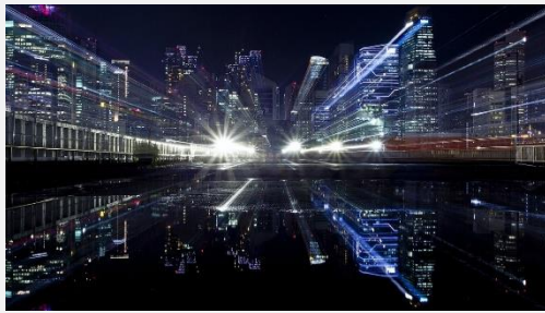
City Life Reimagined