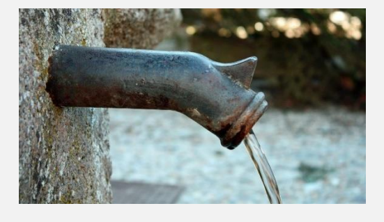
Rapid urbanization increasing pressure on rural water supplies globally