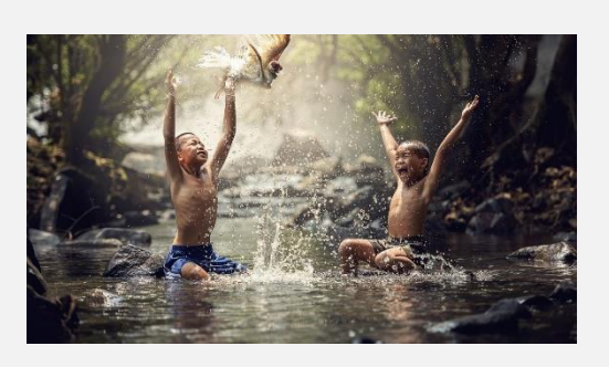
Recovery and Resilience in Lao PDR