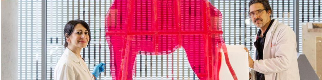
Gino Marotta, Giraffa Artificiale (detail), 1973, polimetilmetacrilato, Museo del Novecento, Milano.