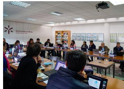
Meeting at the Universidade do Minho in Guimarães, Portugal, with project peer reviewers and structural engineering consultants to discuss the analyses, March 2023.

Read more about this work on our Facebook page