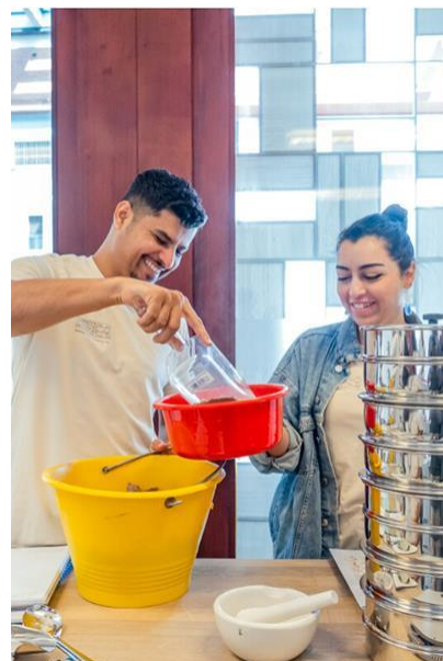
Students study the granulometry of a soil in the laboratory.

The course aims to improve the practice of earthen heritage conservation by providing practical training for mid-career professionals