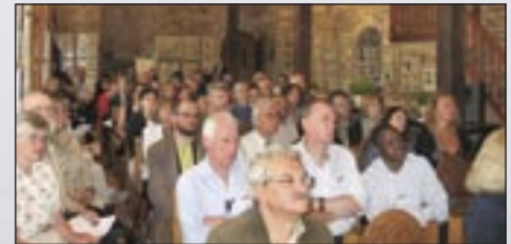
Delegates at the Prigogine Award 2008