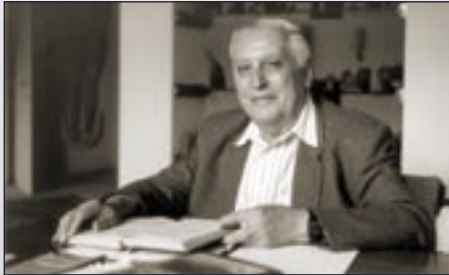
Professor Ilya Prigogine, Nobel Prize Winner

The 2010 award ceremony will be held during The Sustainable City 2010.