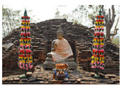
Wat Pa Sak, Chiang Saen, Thailand.

Learn more about the workshop and download the application.