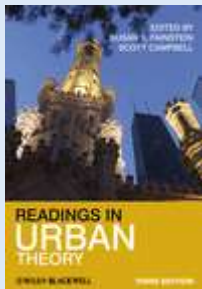
Table of Contents | Author Information

For more information, click the links below: