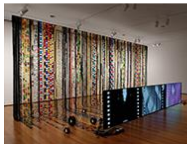
Installation view of Jennifer West: Film is Dead... at the Seattle Art Museum, 2016.