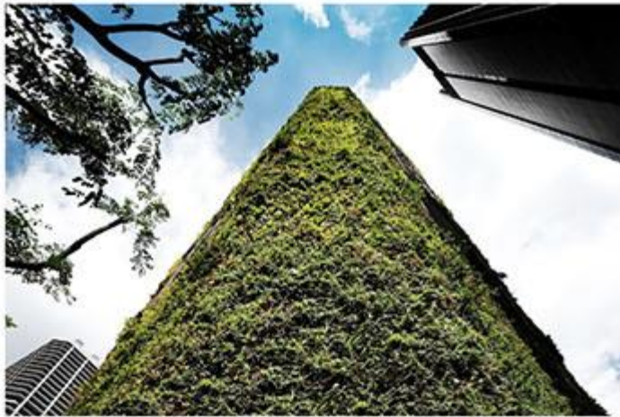
The Oasia Downtown Hotel by WOHA