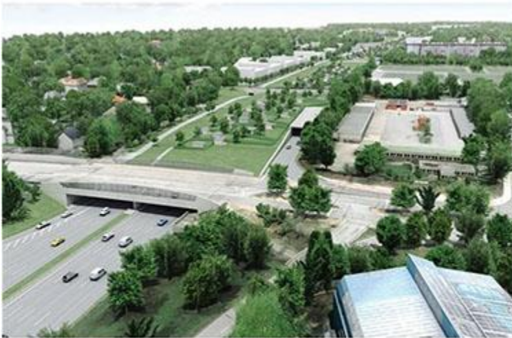
The Autobahndeckel project that will cover the A7 highway with landscape decks in Hamburg

August 2018 | Special feature on the creative urban renewal in Hamburg Nominations for the 2020 Prize are now open! Click here to find out more.