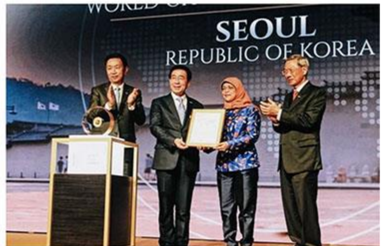
Mr Park Won-soon, Mayor of Seoul (second from left) receiving the Prize from Mdm Halimah Yacob, President of Singapore