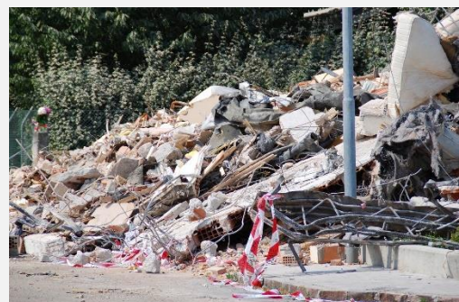
Urban planning: Building resilient cities for the future