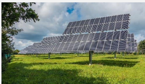
Taking a New Look at Sustainability in the South

Singapore is a story of transformation – from a small trading post to a thriving cosmopolitan city. A densely populated small island with extremely limited resources, how did Singapore manage to evolve into a green, vibrant, and livable city?...Singapore's successful transformation provides practical solutions that can be readily adapted to help developing countries embark on a pathway for a more inclusive, resilient, and sustainable future.