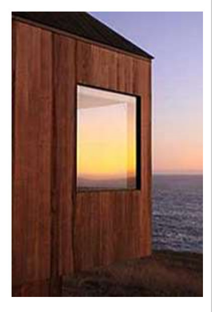
Condominium One, The Sea Ranch.

This event is free, but a reservation is required. Find out more and make a reservation online.