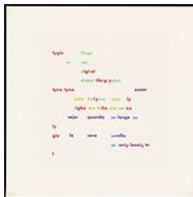
Lygia fingers from Poetamenos, 1953 (print 1973), Augusto de Campos. The Getty Research Institute, Los Angeles.

Listen to episode one if you missed it in October.