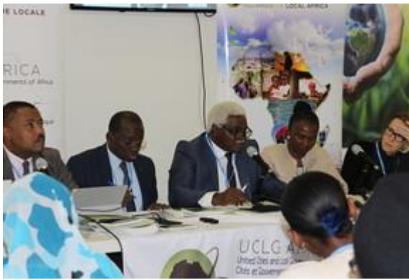
Launch of the UCLG Africa Climate Task Force