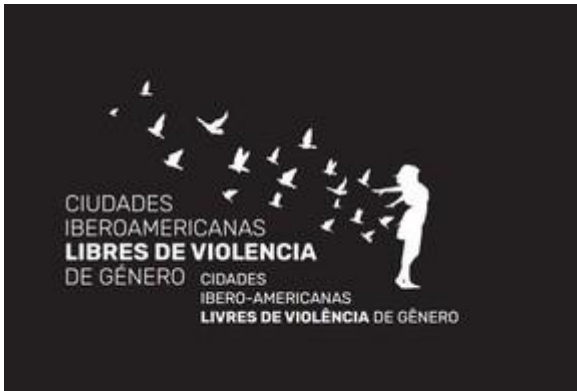
Campaña "Ciudades Iberoamericanas Libres de Violencia de Género"