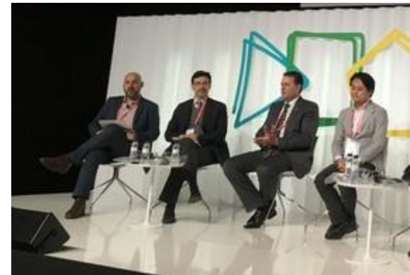
Strengthening Commitment to Urban Innovation and Smart Cities