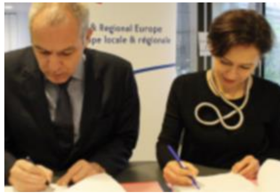
CEMR and the European Commission launch 60 'Local dialogues' with Europeans on how cohesion policy benefits territories