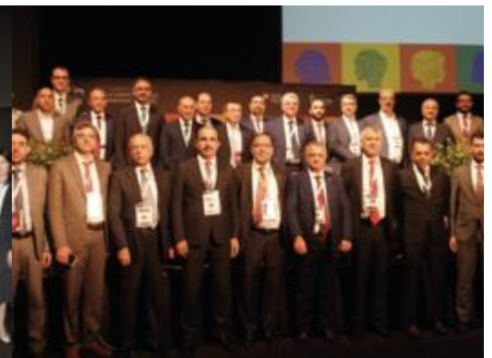
VI UCLG World Congress: Outcomes