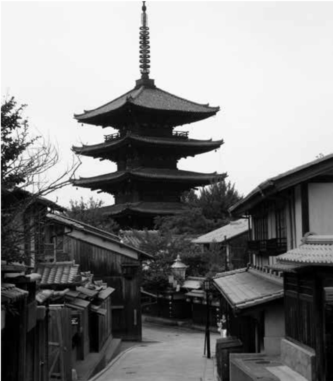
Kyoto (Japan). Higashiyama Area. Yasaka Pagoda