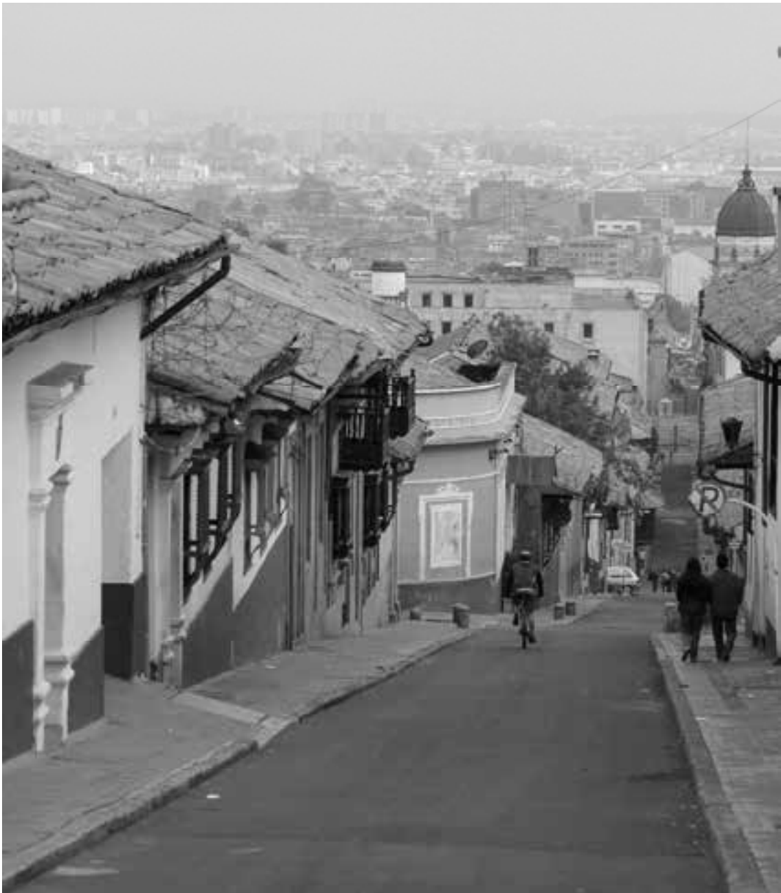
Bogotá (Colombia). Historic Town : Candelaria