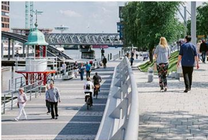
HafenCity, Hamburg: a city of short distances