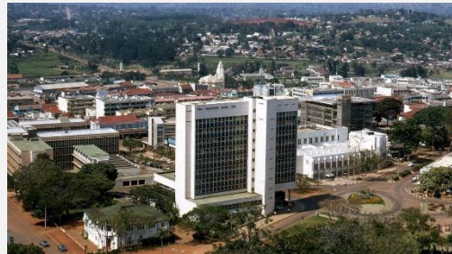
Can Urban Planning Serve Local Economic Development?