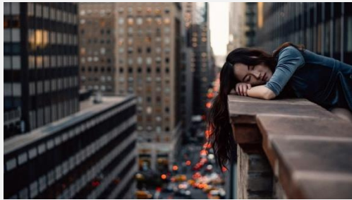
How Will Women Fare as Cities Grow Dramatically? The Data Are Missing