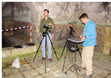
GCI scientist using laser speckle interferometry to detect areas of detachment in wall paintings at the site of Herculaneum.

The Herculaneum Project, a collaboration between the GCI and the Herculaneum Conservation Project (HCP), aims to provide scientific support through analytical investigations that address specific conservation problems at the ancient Roman site of Herculaneum in Italy. The Herculaneum Project falls within the scope of the larger HCP, which is sponsored by the Packard Humanities Institute, and is conducted in collaboration with the Soprintendenza Speciale per i beni Archeologici di Napoli e Pompei, under the management of the British School in Rome.