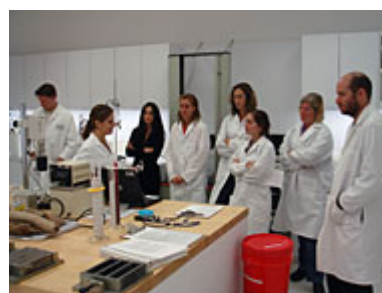
GCI scientists demonstrating laboratory testing of injection grouts to students of the UCLA/Getty Masters Program in the Conservation of Ethnographic and Archaeological Materials.

Find out more about the GCI's project on Injection Grouts for the Conservation of Architectural Surfaces.