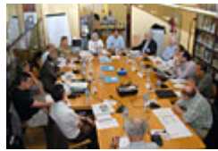
The roundtable at the library of the Museo de la Naturaleza y el Hombre in Santa Cruz, Tenerife, Spain.

The GCI is pleased to make available online the proceedings from the Experts' Roundtable on Sustainable Climate Management Strategies held in April 2007 in Tenerife, Spain. Topics addressed during the two-day roundtable included current climate management strategies and emerging trends; the meaning of sustainability in relation to the preservation of cultural heritage; and whether cultural institutions such as museums, archives, and libraries can or should play a role in the debate about energy consumption.