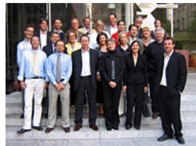
Meeting participants at the Museum of Modern Art, New York.