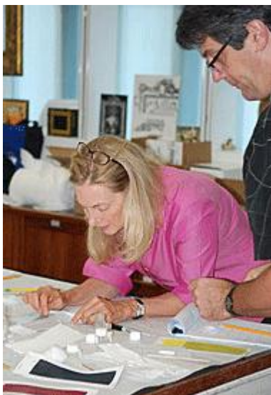
Two participants in CAPS 2009 test clean a sample of acrylic paint.

The GCI's Research into Practice Initiative seeks to advance the practice of conservation through a series of workshops and other educational activities that draw on new scientific research at the GCI and the conservator's perspective.