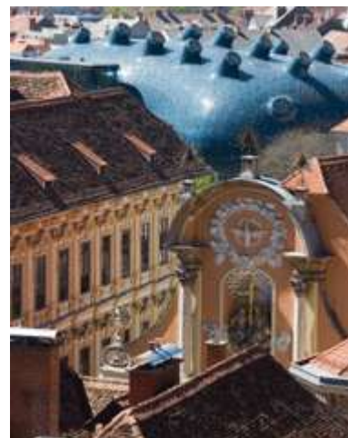
The Kunsthaus Graz, constructed in the historic center of Graz, Austria in 2003.