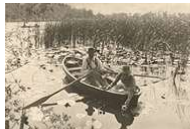
Peter Henry Emerson, Gathering Water-Lilies , 1886 Platinum print, J. Paul Getty Museum.

Find out more about the workshop and apply online.