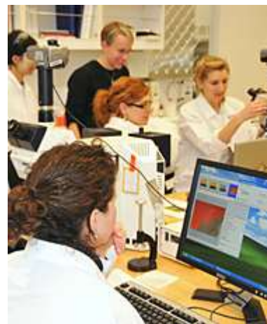
October 2012 workshop at the GCI.

Find out more about the workshop and apply online.