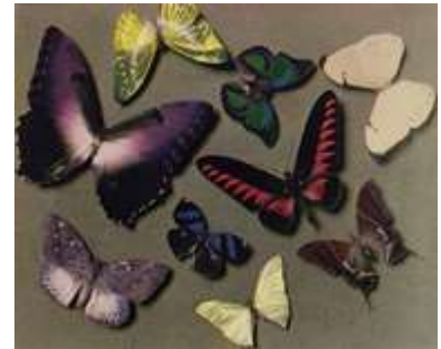
Man Ray, Butterflies, 1930–1935, Carbro print.