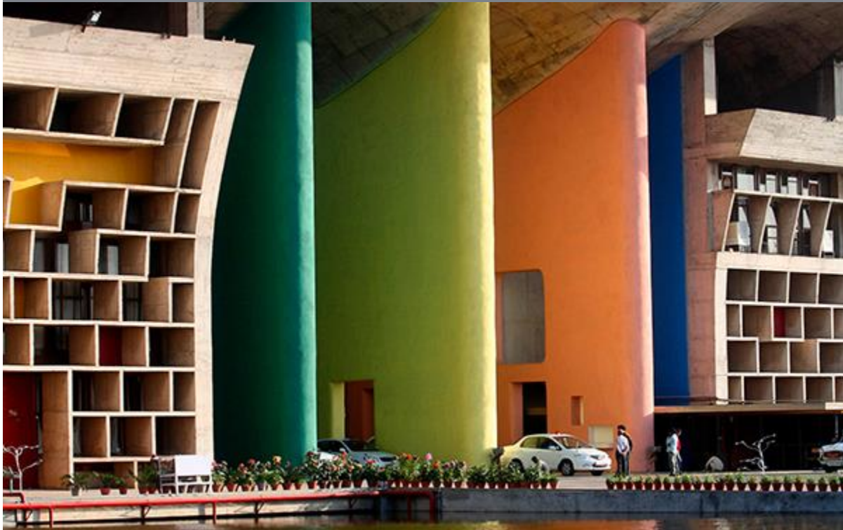
High court building of Chandigarh Union Territory, India.