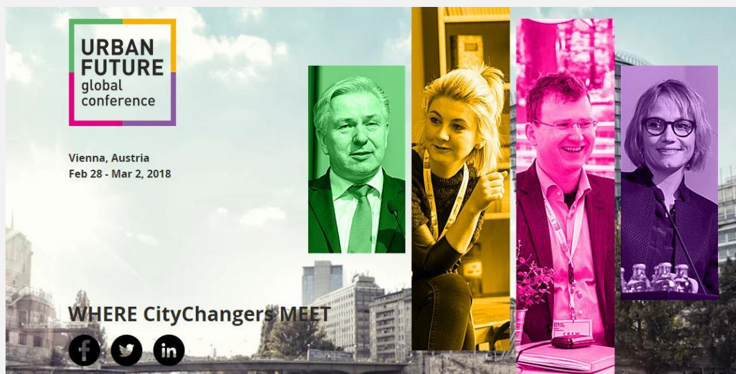
Urban Future Global Conference (28th February to 2nd March, 2018)

The URBAN FUTURE global conference is the World's largest meeting point of CityChangers: committed people that actually drive change to make cities more sustainable. At the URBAN FUTURE you will meet mayors, architects, mobility experts, city planners, scientists, sustainability managers, representatives from Start-Ups, environmentalists, innovation experts and many more. What unites them? Their