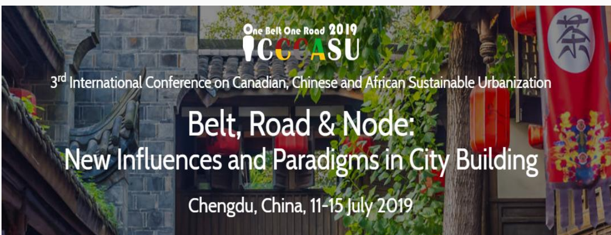
International Conference on Canadian, Chinese and African Sustainable Urbanization (ICCCASU)