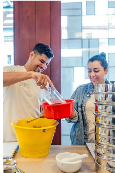
Students study the granulometry of a soil in the laboratory.