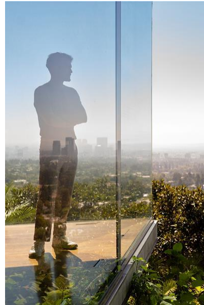
A participant enjoys a tour of the Sheats-Goldstein Residence, designed by John Lautner.