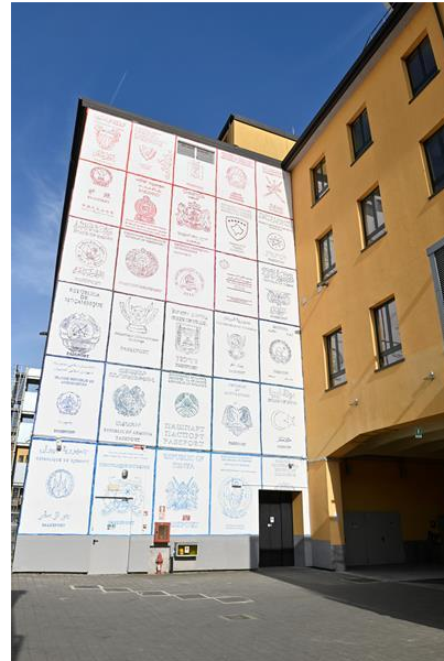
I Trenta , 2023, Flavio Favelli.

Visit symposium website to learn more and register by April 30, 2024