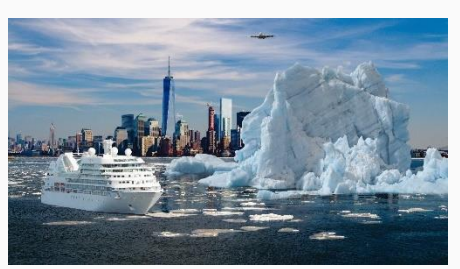
World's Major Cities to Face 'Unknown' Climate Conditions by 2050

Climate scientists at the Crowther Lab, a research group based at ETH Zurich, a science and technology university, analysed 520 cities across the world, including all capitals and most urban centres with a population of more than 1 million...Read more