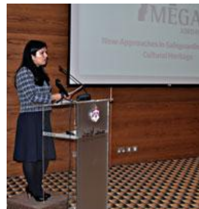
HRH Princess Sumaya bint El Hassan speaking to those gathered for the launch of MEGA Jordan.

Upcoming Public Program: Heritage in the 21st Century City: Managing Growth,