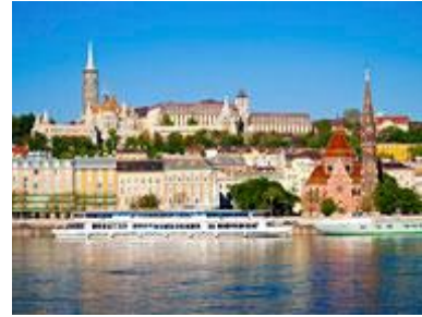
Budapest riverfront cityscape.

Find out more about this free event and make a reservation online.