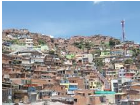
Escalators in Comuna 13

Like many developing cities, Medellín experienced a rapid surge in population from the 1950s. The proliferation of informal settlements in the city and its periphery brought along a host of issues from violence and inaccessibility to housing safety and lack of public infrastructure. What made Medellín stand out, however, was its bold, grounds-up approach to tackling informal settlements and their associated issues.