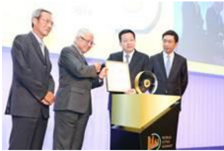
The 2014 edition of the Lee Kuan Yew Prize Award Ceremony and Banquet

The Lee Kuan Yew World City Prize is a key highlight of the World Cities Summit 2016. The prestigious award will be presented to the 2016 Laureate – Medellín at the Lee Kuan Yew Prize Award Ceremony and Banquet, a gala dinner event that celebrates the achievements of the winning city and graced by our Guest-of-Honour the Prime Minister of Singapore Mr Lee Hsien Loong.