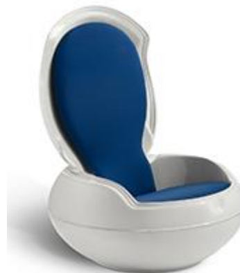
Garden Egg Chair, 1971. Peter Ghyczy, designer. VEB Synthesewerk Schwarzheide, producer.

With partners The Wende Museum , TH Köln , and Die Neue Sammlung , we are researching the production processes and technologies of plastic materials used in industrial design in the German Democratic Republic (GDR) between 1949 and 1990. The project's objective is to better understand the degradation of these materials, and to generate recommendations for their conservation treatment.