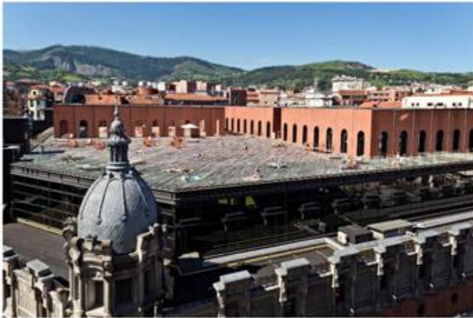
The new Azkuna Zentroa cultural centre in Bilbao

Stage A nominations closing soon on 31 March 2017 | More info »