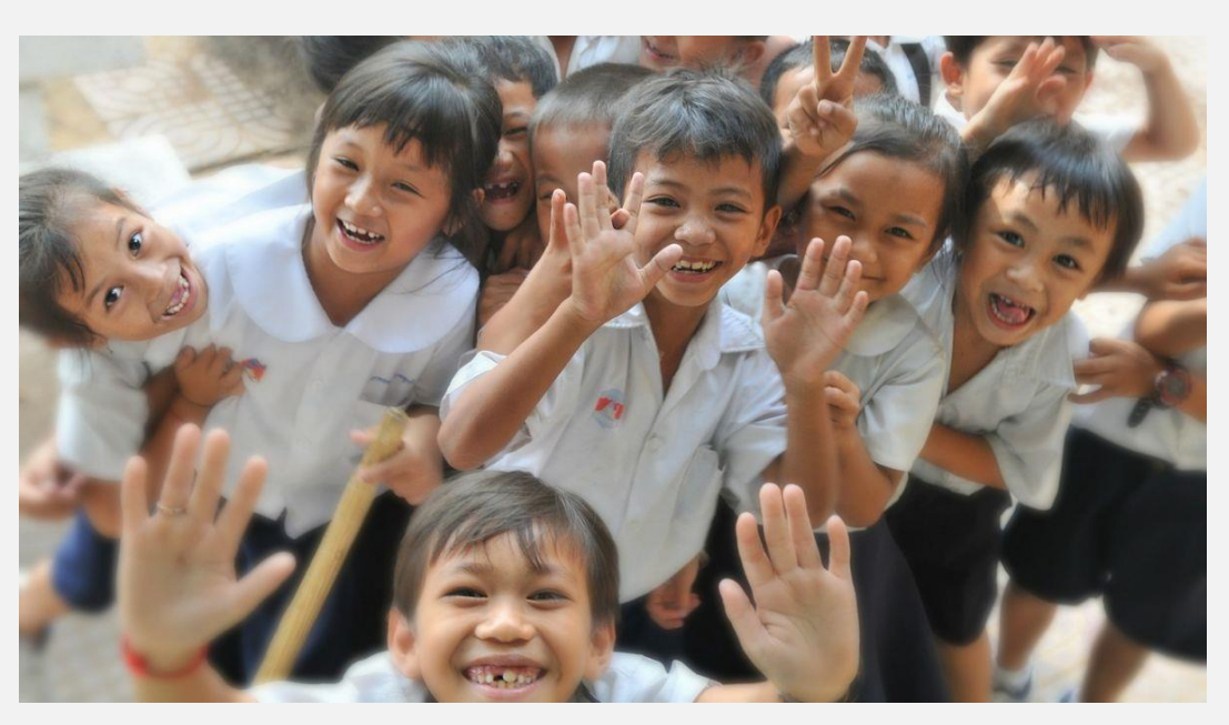
The Happiness Movement: How Cities Around the World are Pursuing Joy by Fostering Social Change

'If you want to solve poverty and marginalization, the smartest approach is to get the experts — the poor and marginalized — to help with solutions'. The authors of the report offer a mountain of evidence that human happiness is a much smarter measure of success for cities and nations than just economic growth