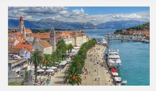
<u>Developing Resilient Communities</u> <u>within Cities</u>

'If you want to solve poverty and marginalization, the smartest approach is to get the experts — the poor and marginalized — to help with solutions'. The authors of the report offer a mountain of evidence that human happiness is a much smarter measure of success for cities and nations than just economic growth