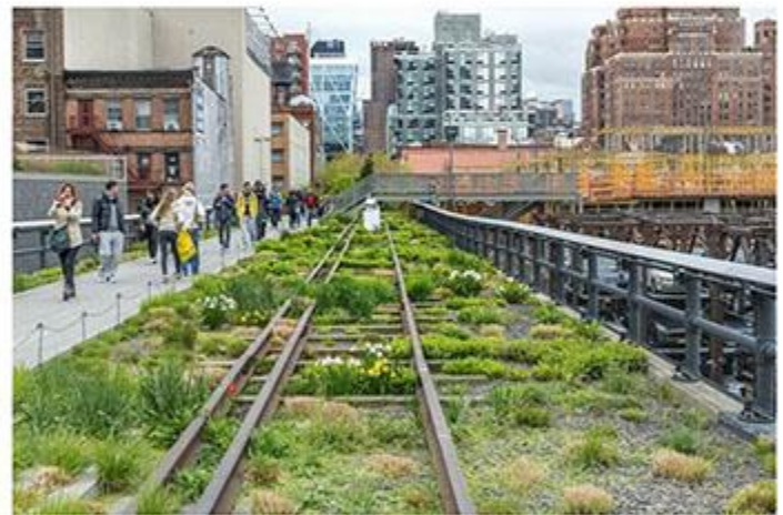
The High Line in New York City