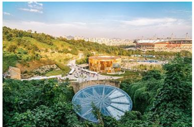
Mapo Culture Depot transformed the disused oil tank facility into a new arts and culture venue