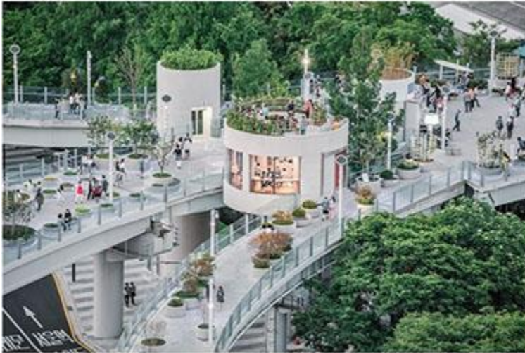
Seoullo 7017 converted the former Seoul Station Overpass into a lush sky garden

May 2018 | Special feature on Seoul's innovative urban regeneration