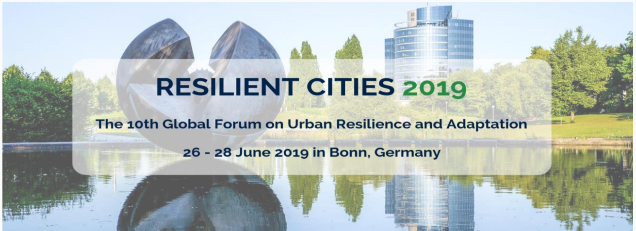
The 10th Global Forum on Urban Resilience and Adaptation (26th to 28th June 2019)

Resilient Cities – The Annual Global Forum on Urban Resilience and Adaptation – is hosted every year in Bonn. In 2010 ICLEI – Local Governments for Sustainability, the World Mayors Council on Climate Change and the City of Bonn, Germany launched Resilient Cities, the first forum on cities and adaptation to climate change (in 2012 renamed as Global Forum on Urban Resilience and Adaptation)