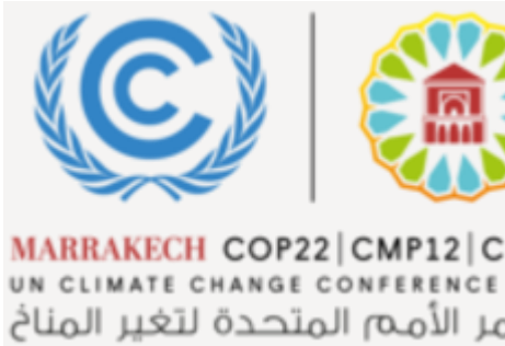
The UCLG Committee activities at COP22

07/11/2016 by: Standing Committee on Gender Equality