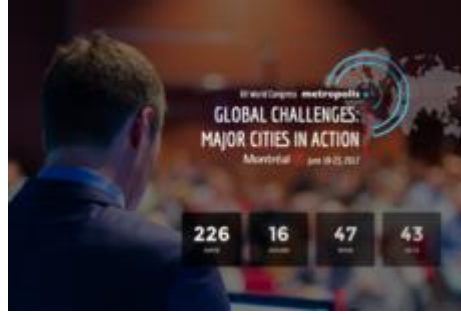
Global challenges: major cities in action, 12th Metropolis World Congress