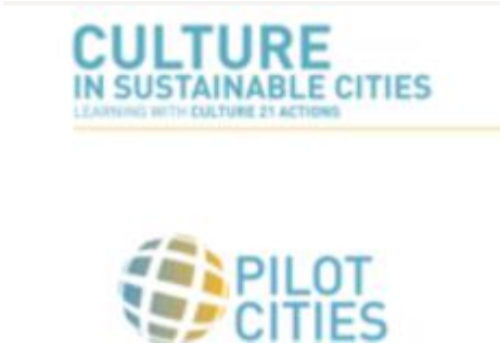
New call pilot cities 2016-2019 before 30 November

04/11/2016 by: UCLG Committee on Local Finances