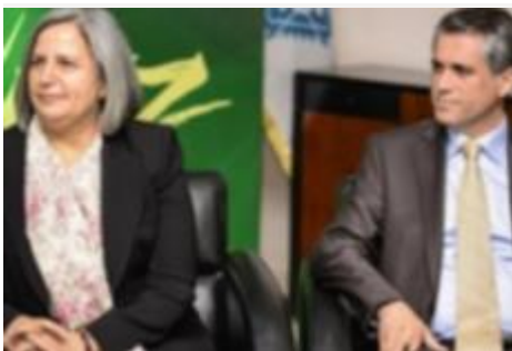
The Committee calls for safeguarding local democracy in Turkey

04/11/2016 by: UCLG Committee on Culture