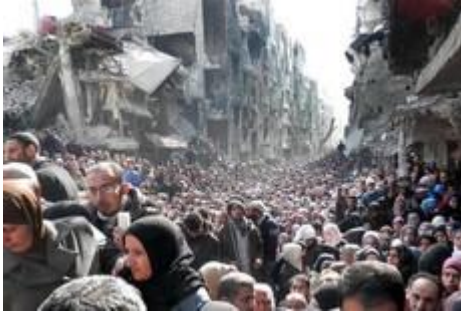
Turkey and Lebanon municipalities in the Syrian migratory influx management