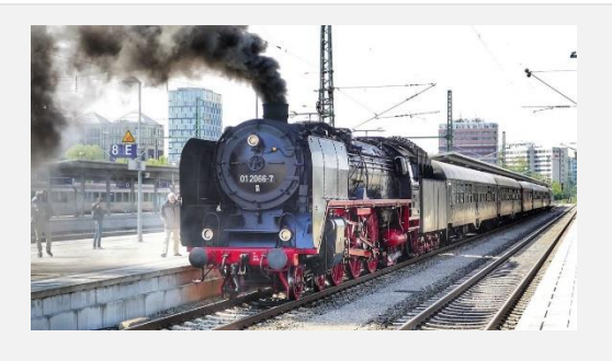
Four ways our cities can cut transport emissions in a hurry: avoid, shift, share and improve