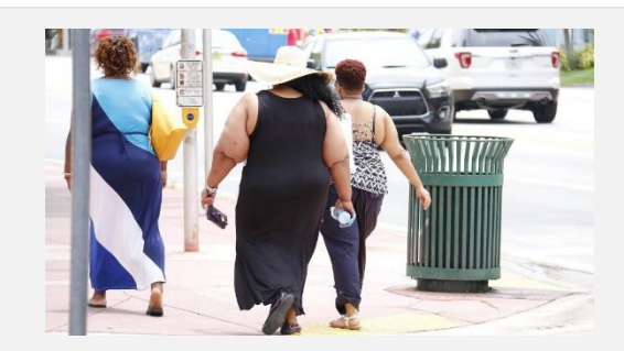
<u>Urbanization associated with lower</u> <u>rates of child stunting but higher rates</u> <u>of obesity among women</u>