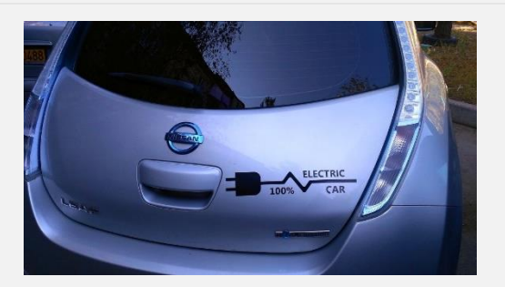
<u>5 Reasons EVs Alone Aren't Enough to Address Climate Change</u>

Fast growing cities need viable solutions for rapid urbanization and population growth.