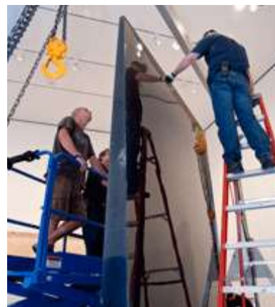
Installing Gray Column . Artwork © De Wain Valentine.

Roy Lichtenstein's Outdoor Painted Sculpture Three Brushstrokes (1984): Analysis of Paint Structure and Composition