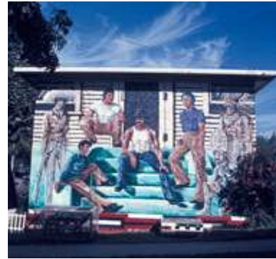
Ghosts of the Barrio by Wayne Healy. Photographed ca. 1970-74. © Wayne Healy