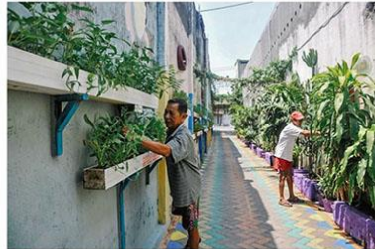
Cleaning activities at Kampung Gadukan

In this photo essay, we look at how Surabaya advances itself as a modern clean and green 'kampung' city.