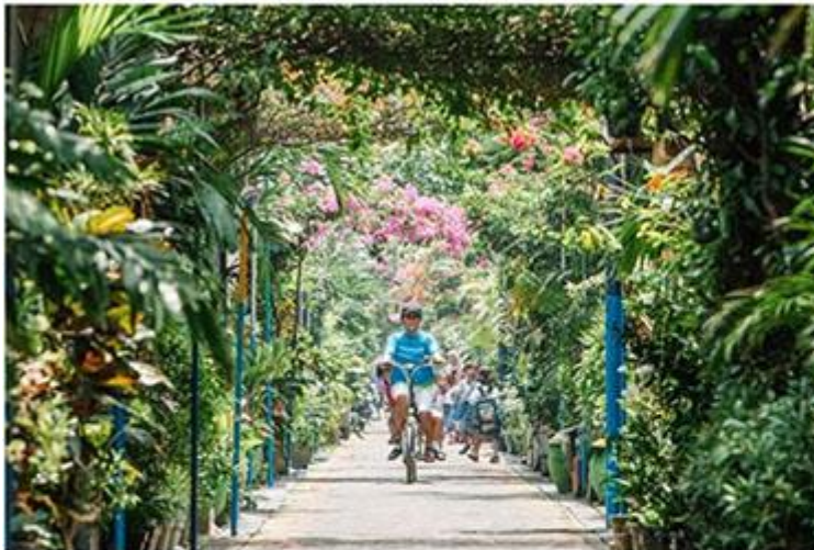
Kampung Dukuh Setro, one of the preserved neighbourhoods of Surabaya

Nominations for the 2020 Prize are now open! Click here to find out more.