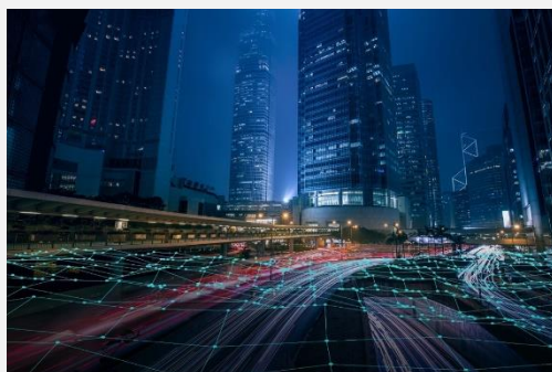
To be or not to be a smart city

Investing in resilience always pays. Mobilise finance for skills enhancement, technology transfer and demonstrations to put in place the tools needed for early warning systems, preparedness, risk-informed development planning and better use of natural resources for sustainable energy practices.