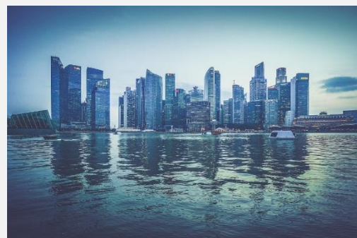
Innovations in Urban Water Reuse