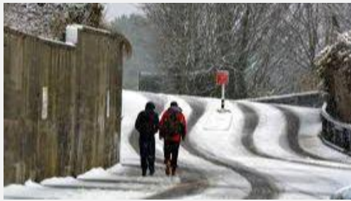
Walk the talk: Cities urged to study footpaths for better land use