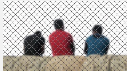
The World's Largest Refugee Camp Is Becoming a Real City