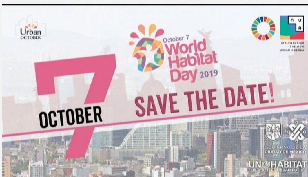
World Habitat Day (7th OCTOBER 2019)

World Habitat Day, observed on the first Monday of October each year, supports UN-Habitat's mission towards transformative change in cities and human settlements – to leave no one and no place behind. Building on last year's theme "Municipal Solid Waste Management" UN-Habitat is this year promoting the contribution of innovative frontier technologies to sustainable waste management to achieve Sustainable Development Goal 11: inclusive, safe, resilient and sustainable cities.