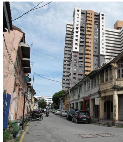
Kedah Road, George Town, Penang, Malaysia

The course will follow the Historic Urban Landscape approach and will examine methodologies, practical tools, and techniques for the conservation of historic places. In addition to the online workshop, there is the potential for an onsite case study later in 2024.