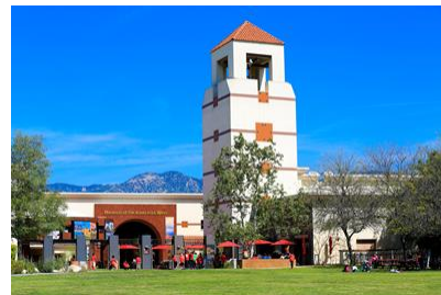
Autry Museum of the American West.