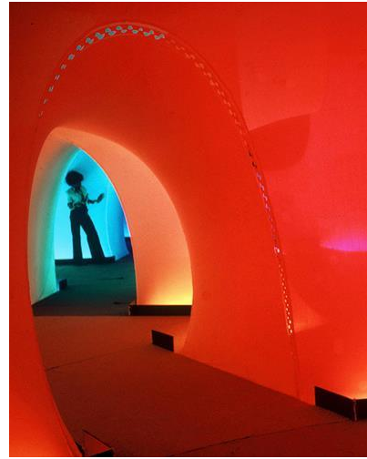
Spectral Passage , 1975, Aleksandra Kasuba. Installation view (detail), M. H. DeYoung Memorial Museum, San Francisco.