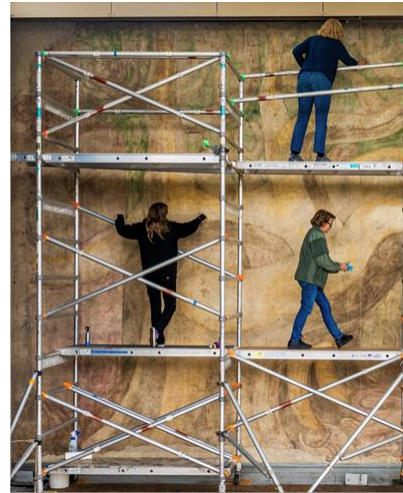
Conservators carry out maintenance treatment on América Tropical (detail).

Read details and reserve your free ticket