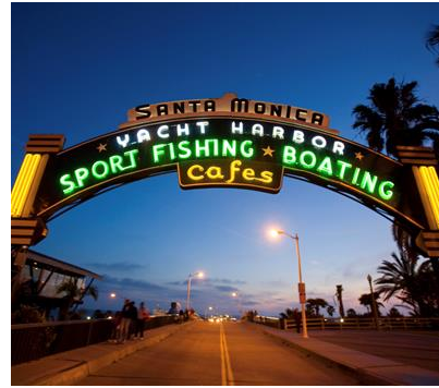
The neon Santa Monica Pier sign is a designated historic landmark in the city.