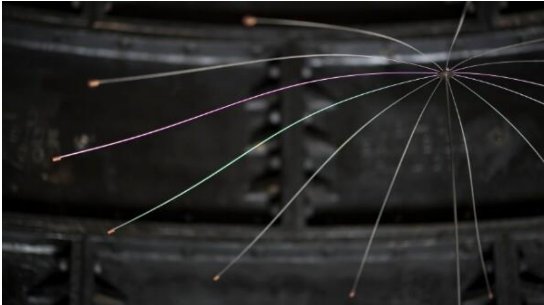
Umbrella , 1971, Wen-Ying Tsai

Artwork: © 2024 Tsai Art and Science Foundation/ Artist Rights Society (ARS), New York,