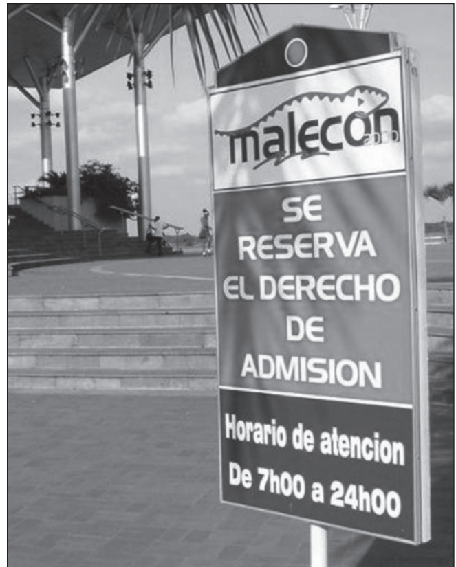
Public board in Malecón 2000 in 2003.

That same year, people held protests such as the Gay Pride Parade on Nueve de Octubre Avenue, even though there was a municipal ban on the execution of this event. Activists also held a event called, "The tongue does not reserve the right of admission," where artists and social activists invited journalists, couples and the general public to be on the Malecón 2000 and passionately kiss each other in protest of legislation that forbade public displays of affection in public spaces. The "Rockers Parade" along the Malecón 2000 was staged to promote free access to these areas by removing signs displaying the message: We reserve the right to admission.