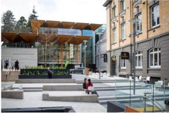
Khartoum Place – a pedestrianised city square in Auckland – is one of the many public spaces in the city rejuvenated through design-led initiatives.