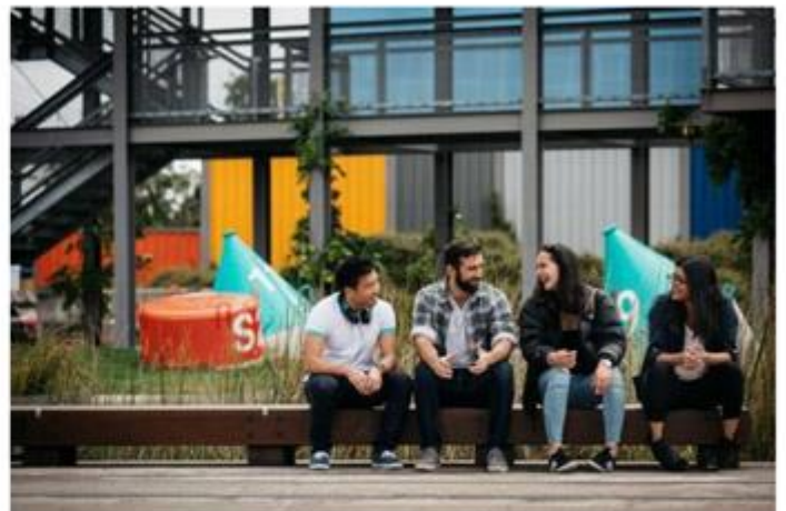
Creating a vibrant, liveable city for everyone. © Auckland Council

Click here for a visual walk-through of some of the city’s outstanding urban transformation led by Auckland’s Design Champion Ludo Campbell-Reid.