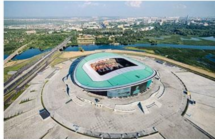
Kazan Arena