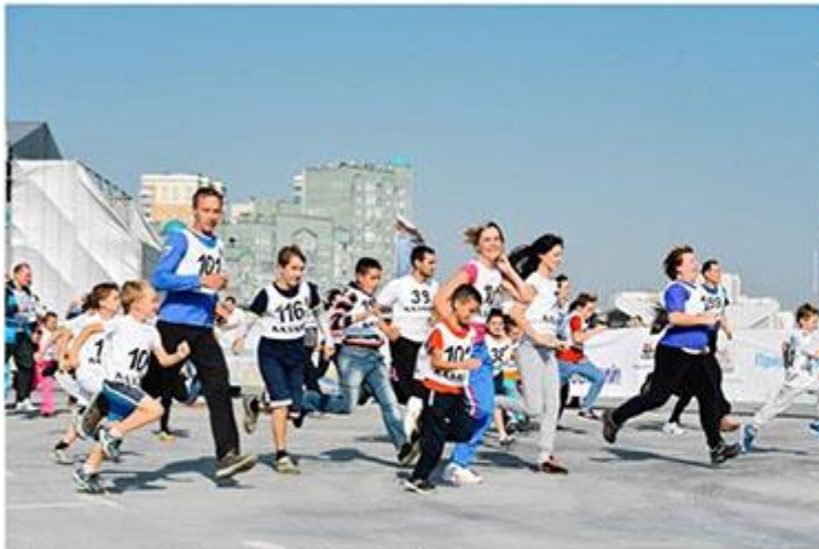
Mass sports in Kazan

Nominations for the 2020 Prize are now open! Click here to find out more.